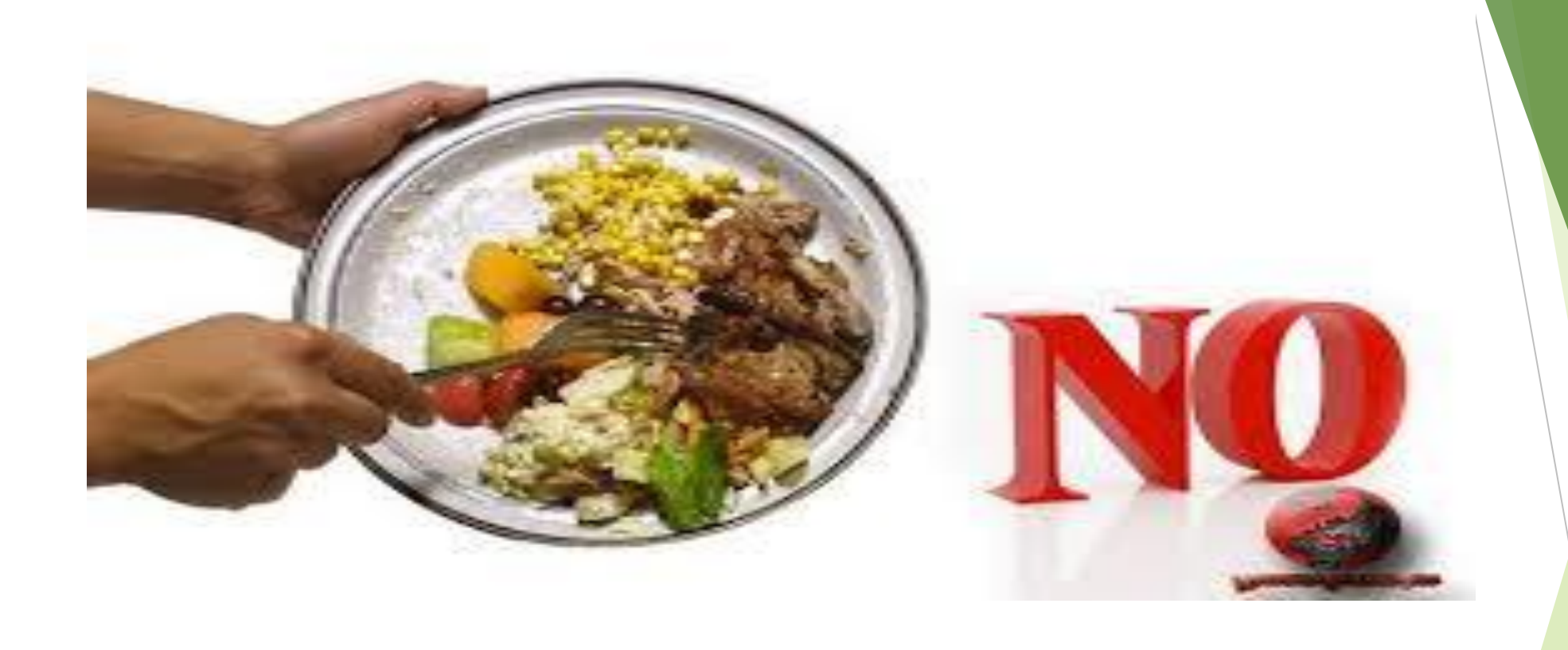
2° Avoid any waste