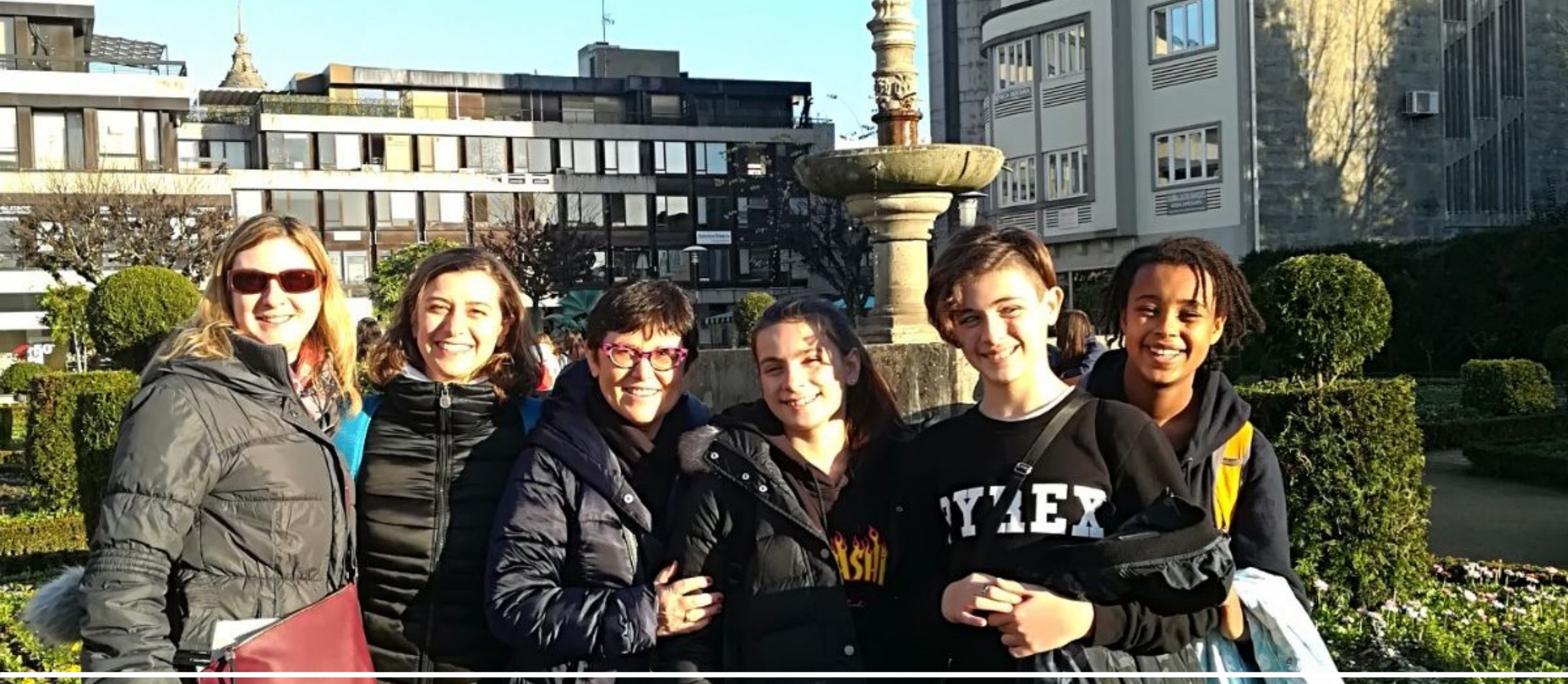
The Italian group