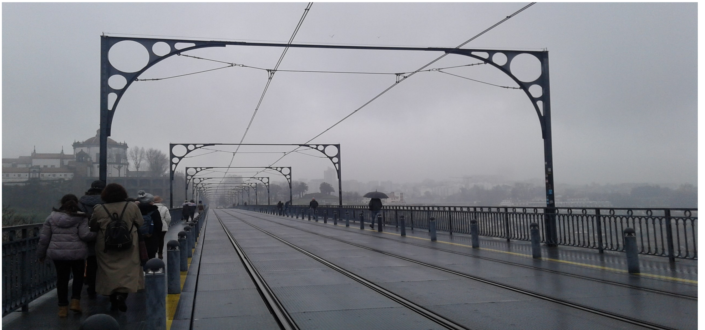
Bridge connecting Porto to Villanova de Gaya