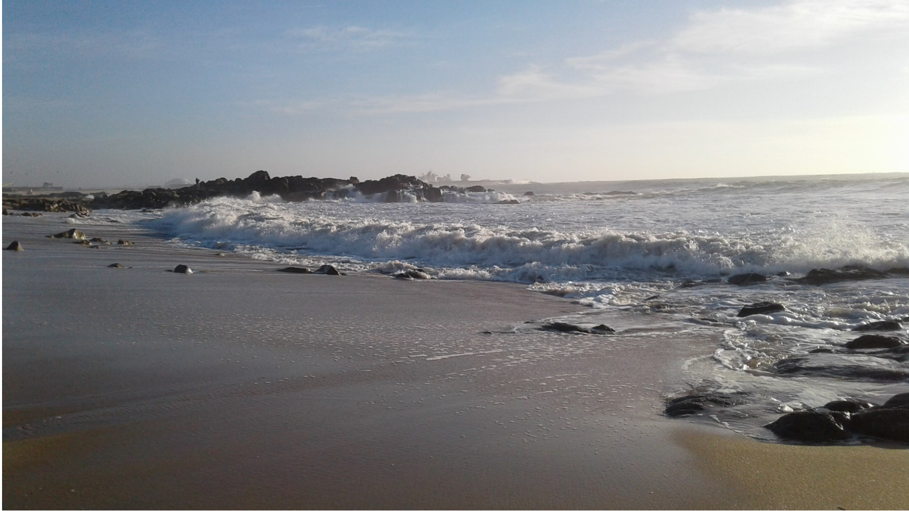
The Atlantic Ocean