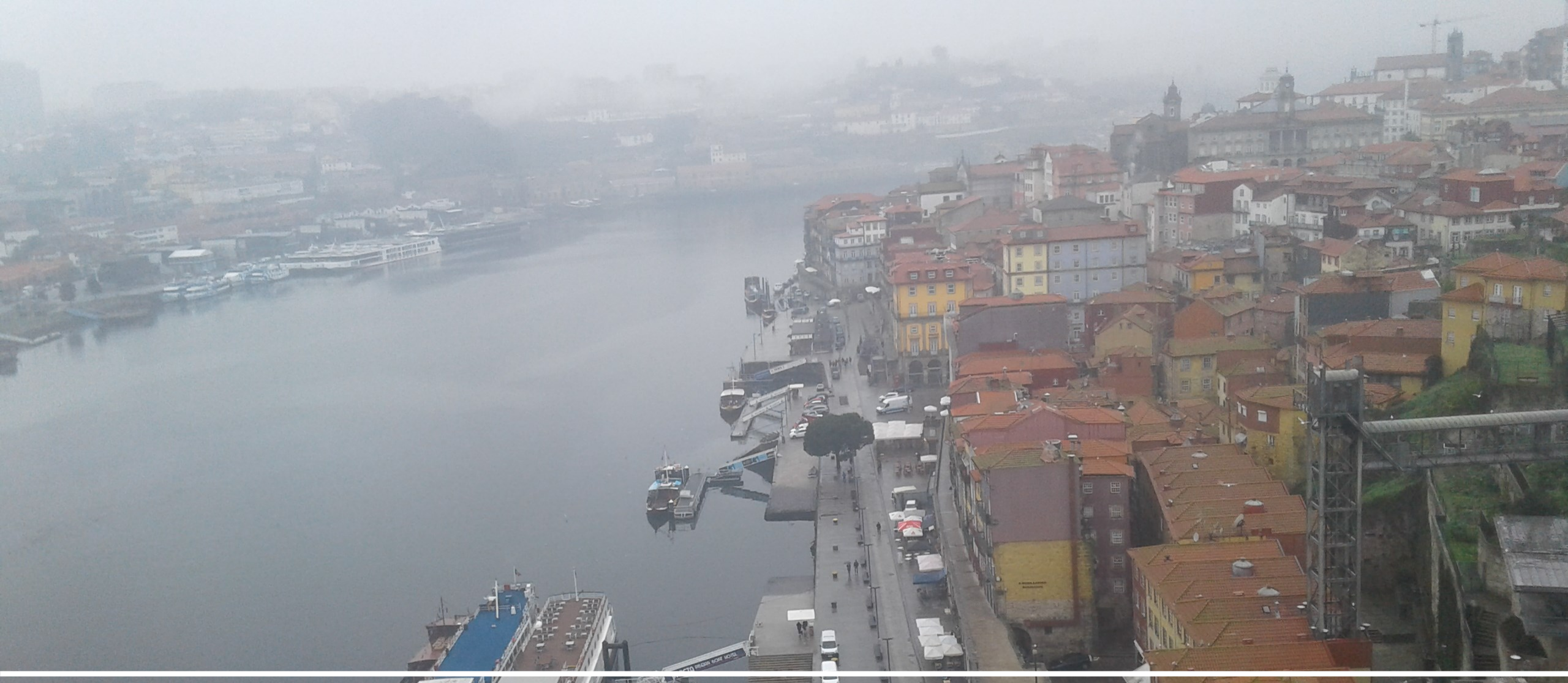
View of Duero river from the bridge