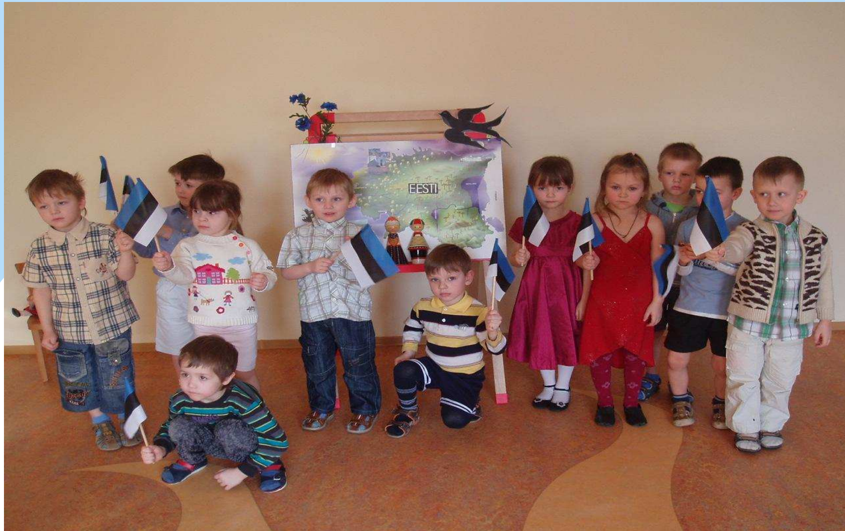
One of the groups involved in the kindergarten program of partial immersion.