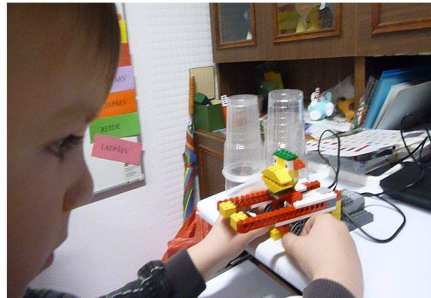
Kindergarten had Lego Vedo project.